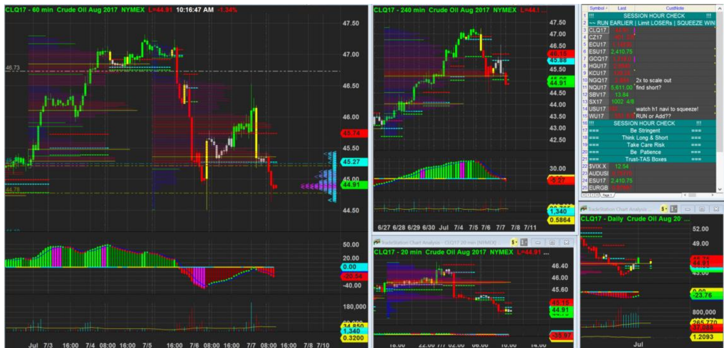
7/7/2017 10:16 - Screen Clipping

Watching out for pull back short near 45 area.